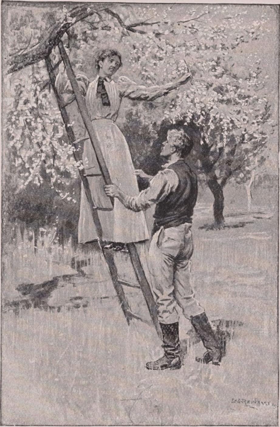
Above their heads the branches twined